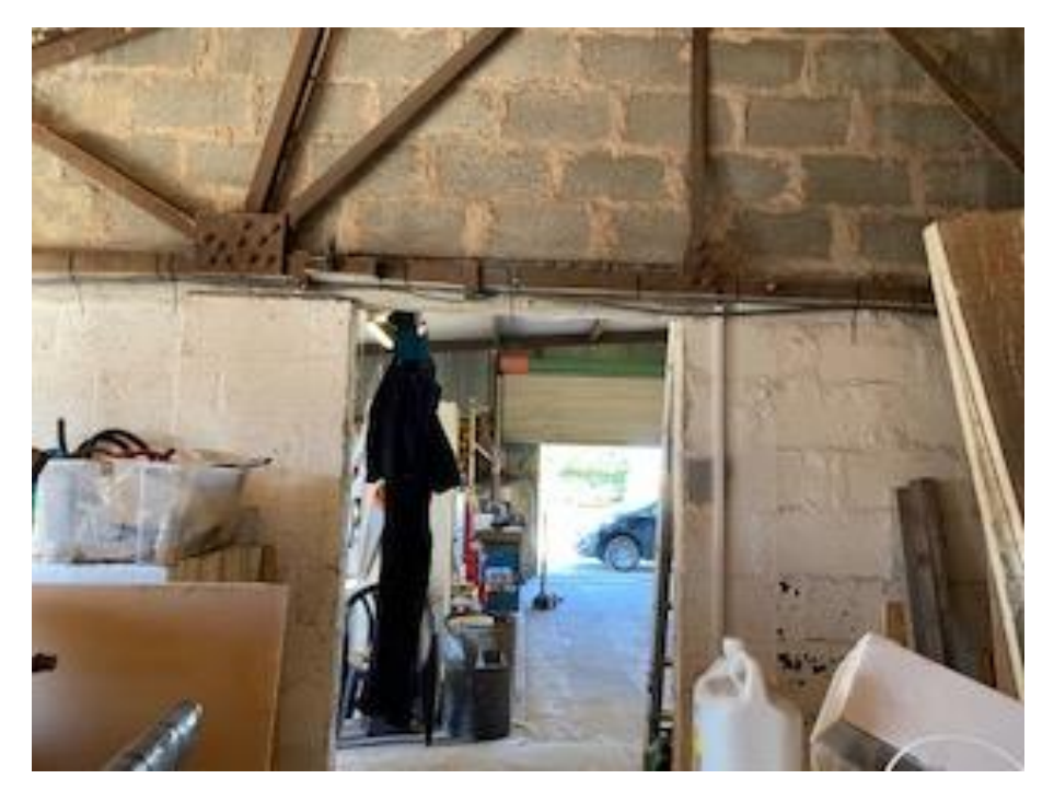
Photo 5 view from the snug area to into potential main bar to the outside car park area