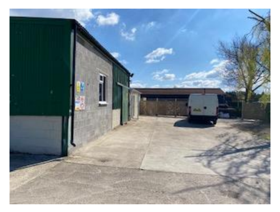
Photo 7 view outside showing the start of the potential outdoor seating area