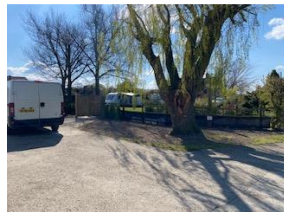
Photo 2 the planned outdoor area for the bar. Directly behind this is the premises of the owners, then another property to the left of theirs.