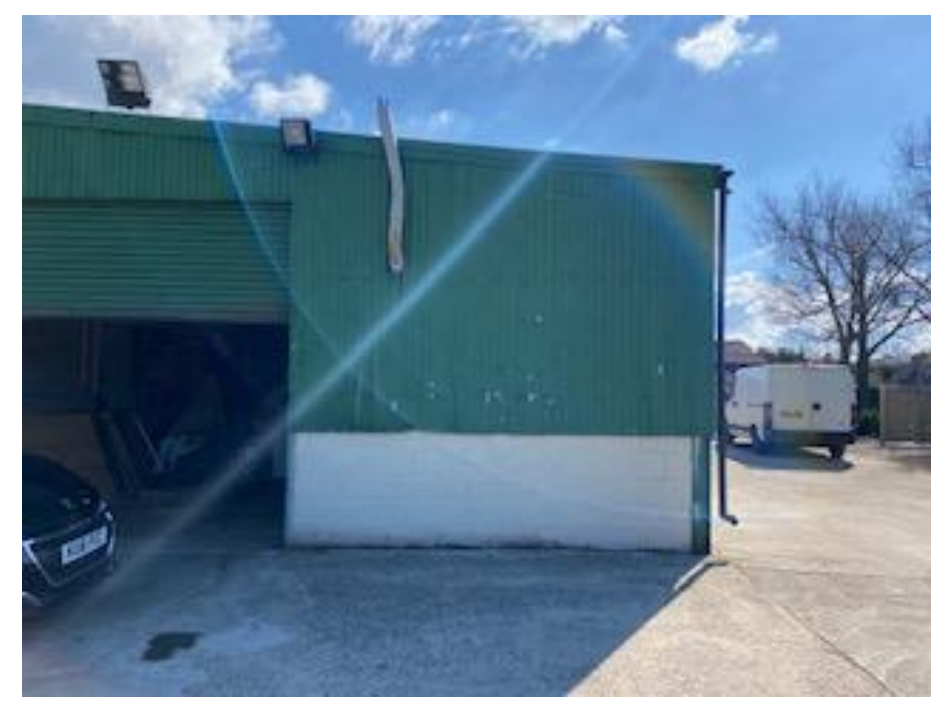
Photo 6 View from the carpark area of the premises to the right would lead to the potential outdoor seating area.