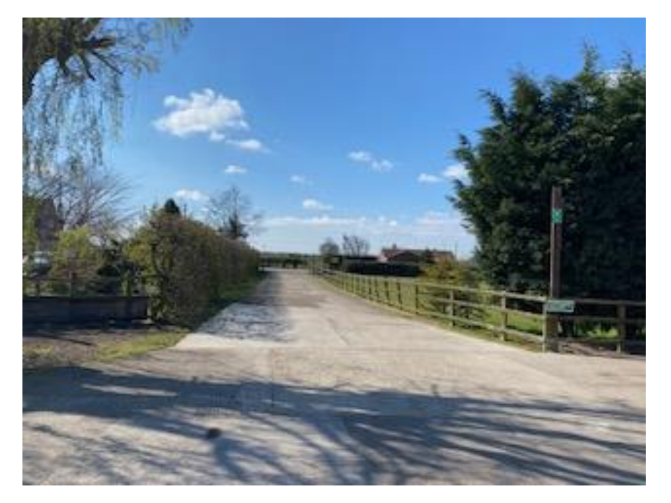
Photo 1 view to the exit and main road. There is a gate at the end and a small area for cars to pull in