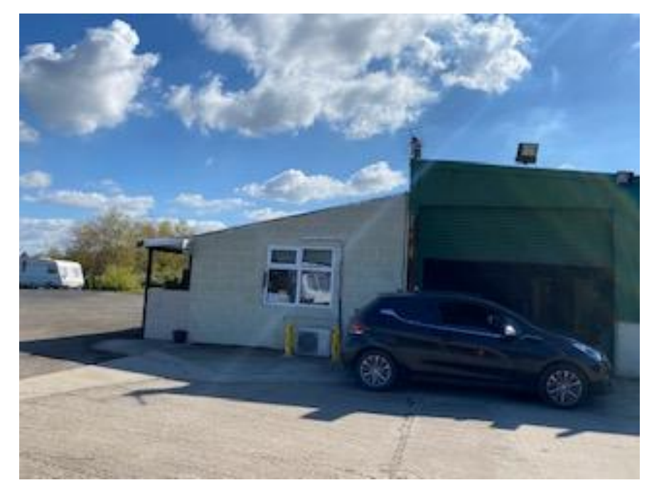
Photo 8 view from the outside of the potential bar and to the left the campsites main reception area, which also leads to the showers at the back.